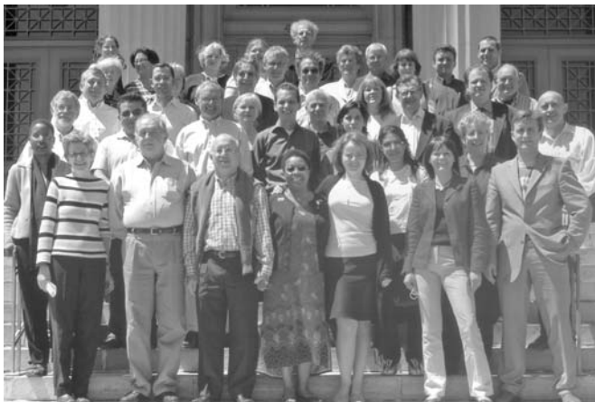
Member country delegates at the International Federation of Little Brothers of the Poor General Assembly, June 2004.

Gratitude is extended to the International Federation General Assembly hosts, Les petits frères des Pauvres du Québec.