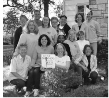
Volunteer Program Staff Retreat, September 2004

The National Office sponsored the second annual Volunteer Program Staff Retreat . Staff members gathered to reinforce each other's commitment to the organization, its volunteers, and the elders who would otherwise be alone. Occurring immediately after the General Assembly, this gathering built on the plans created at the group's 2003 meeting and developed new plans to improve the structures, standards and policies of each chapter's Volunteer Program.