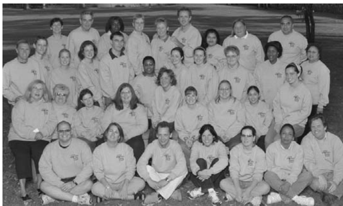
Chapter delegates at the 2004 USLBFE General Assembly.